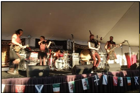
CELTICA PIPES ROCK