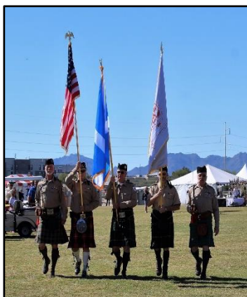
Opening ceremonies with the Scottish American Military Society Honor Guard

First Annual Halfway to Highlands Golf Tournament – Saturday, May 11, 2019!