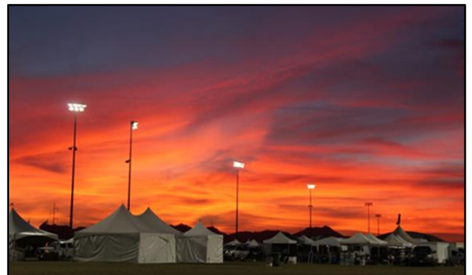
A sky to end all